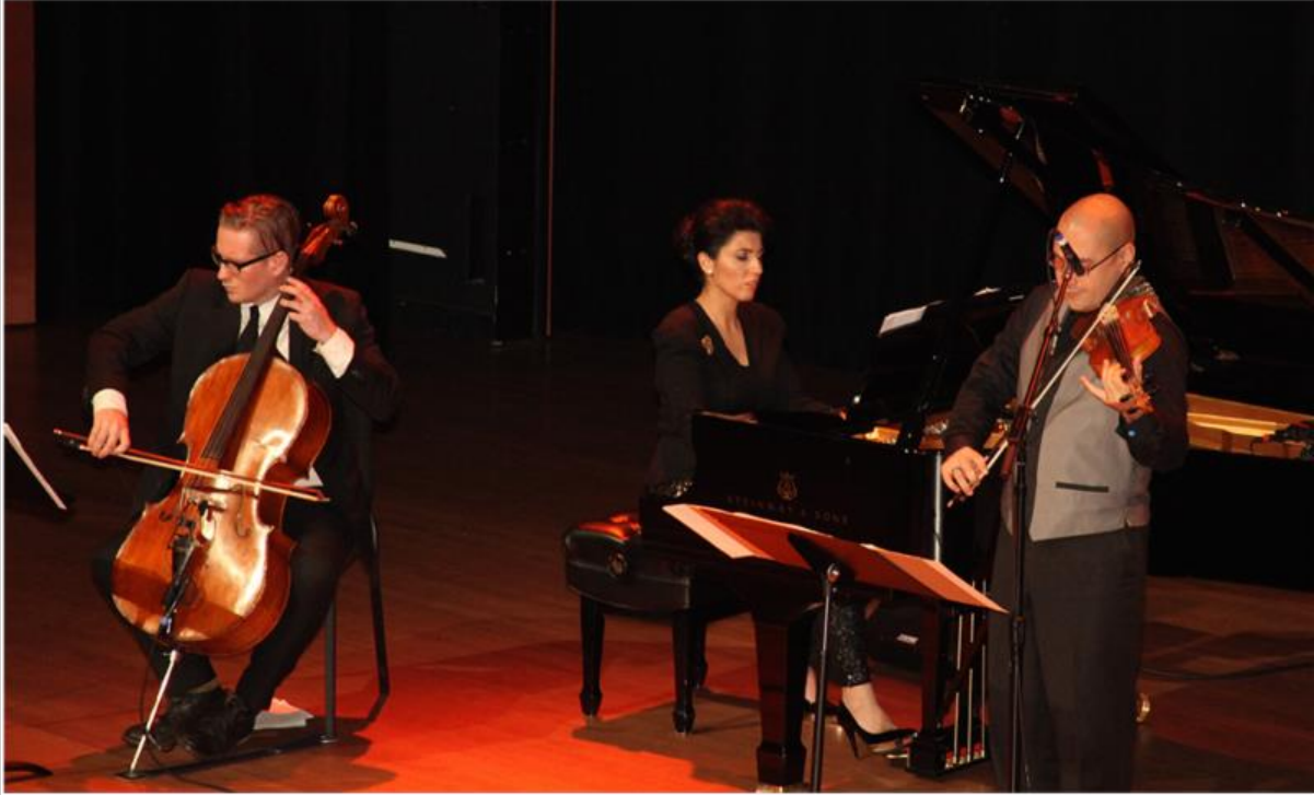
Composer and Pianist Tania Eshaghoff and Ensemble