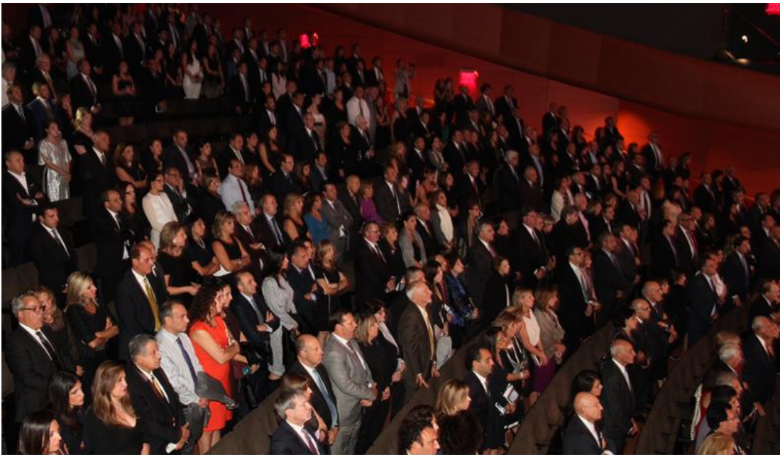
IAJF 13th Annual Gala at Alice Tully Hall, Lincoln Center, NY City