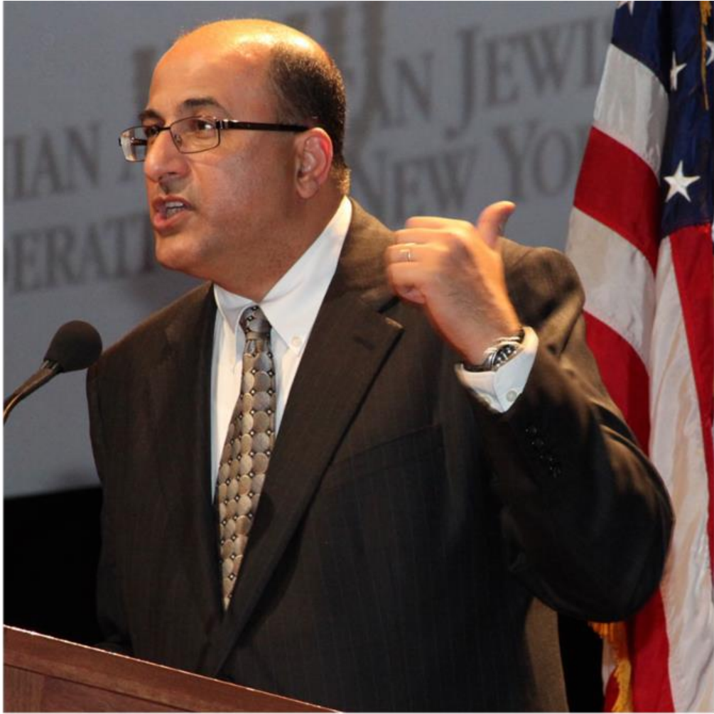
Ambassador Ido Aharoni, Consul General of Israel in NY