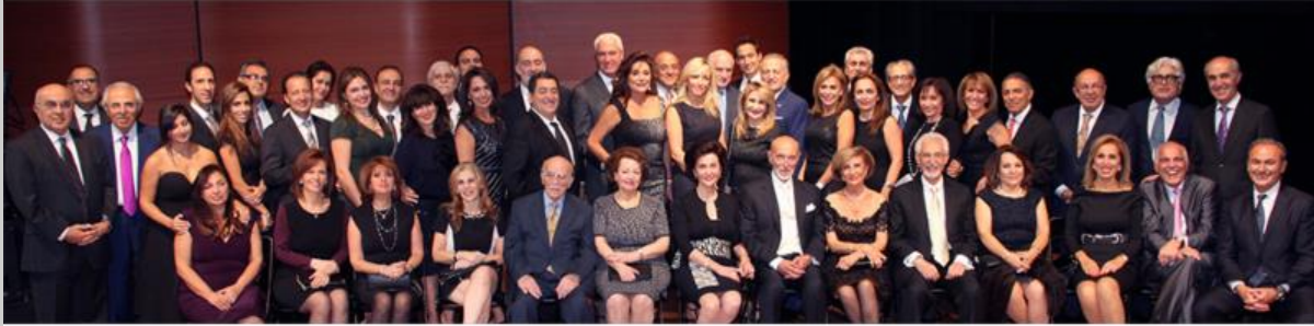
IAJF Board Members with Special Guests