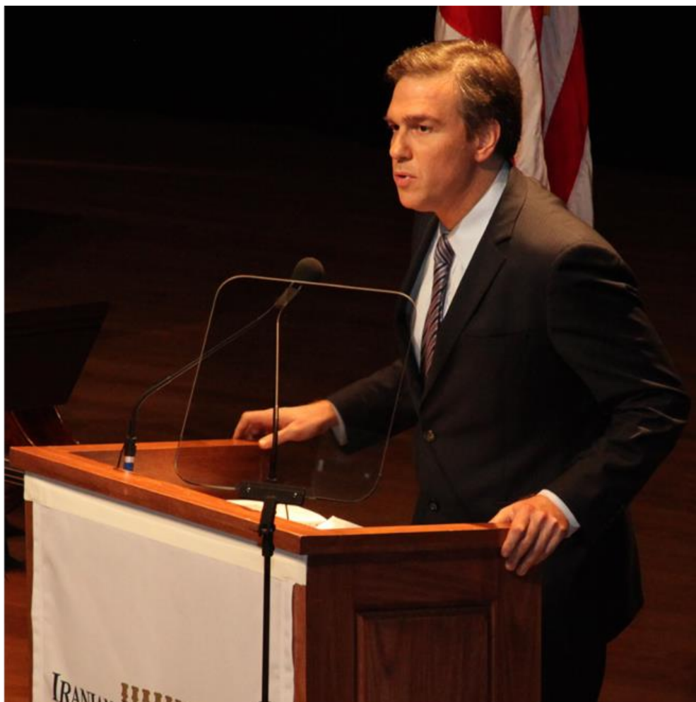
Special Guest Speaker, Bret Stephens, Foreign Affairs Columnist