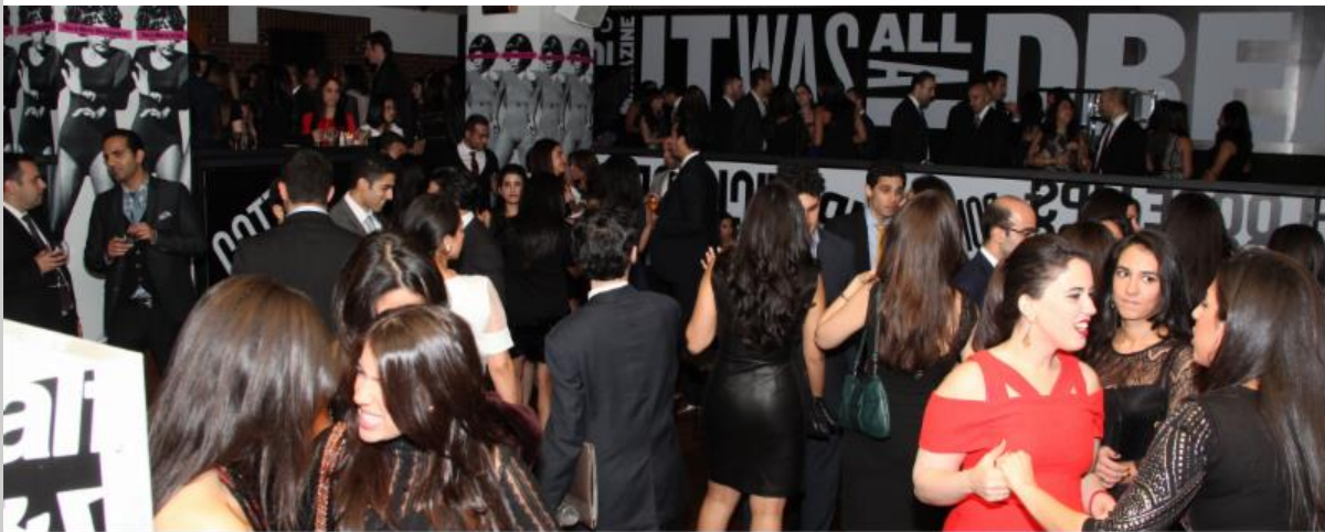
Young Leadership Division Gala After Party at the Hudson Hotel